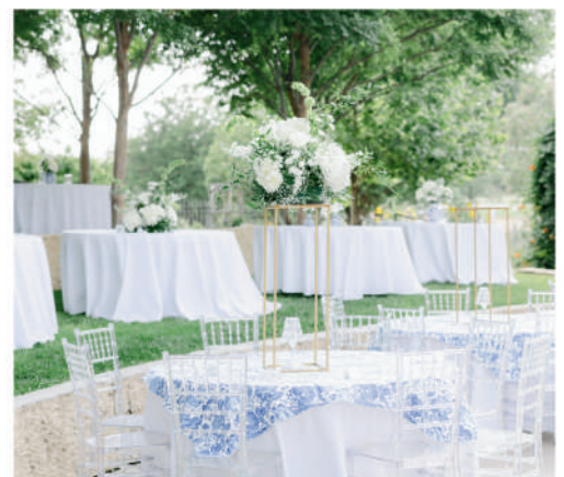
Event Rentals | Page 6