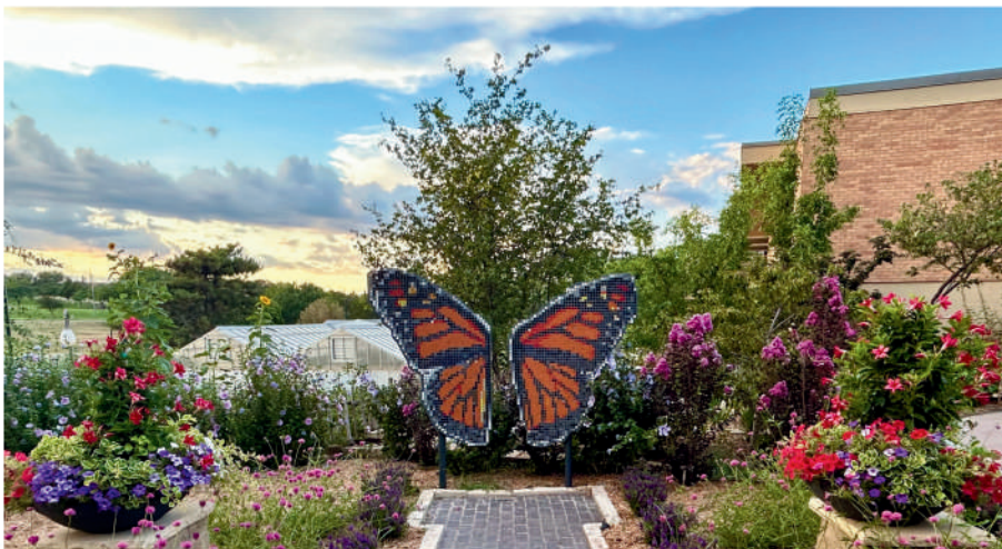
Day with the Butterflies | Page 3