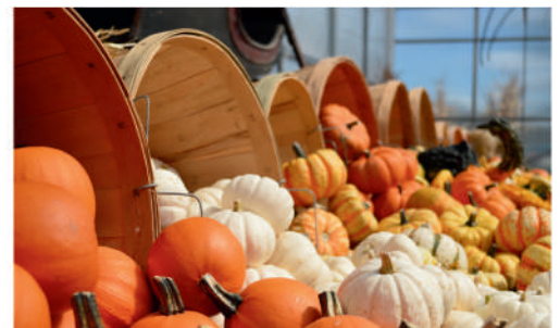
Pumpkin Fest | Page 4