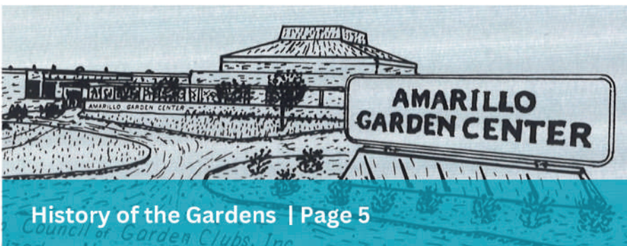
History of the Gardens | Page 5