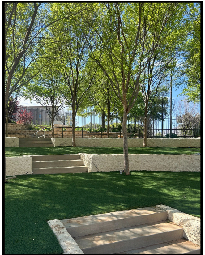
Pictured on the right: The Amphitheater artificial turf renovations. Work is being done by Green Plains Design and the ABG staff.